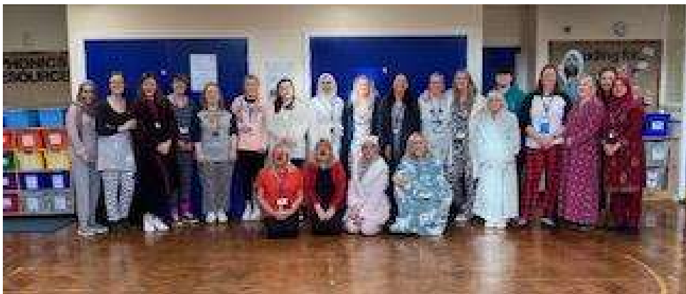
Firefighting, music, baby Isabelle and Comic Relief red nose pizzas...just a snippet of another busy week at Steeton.